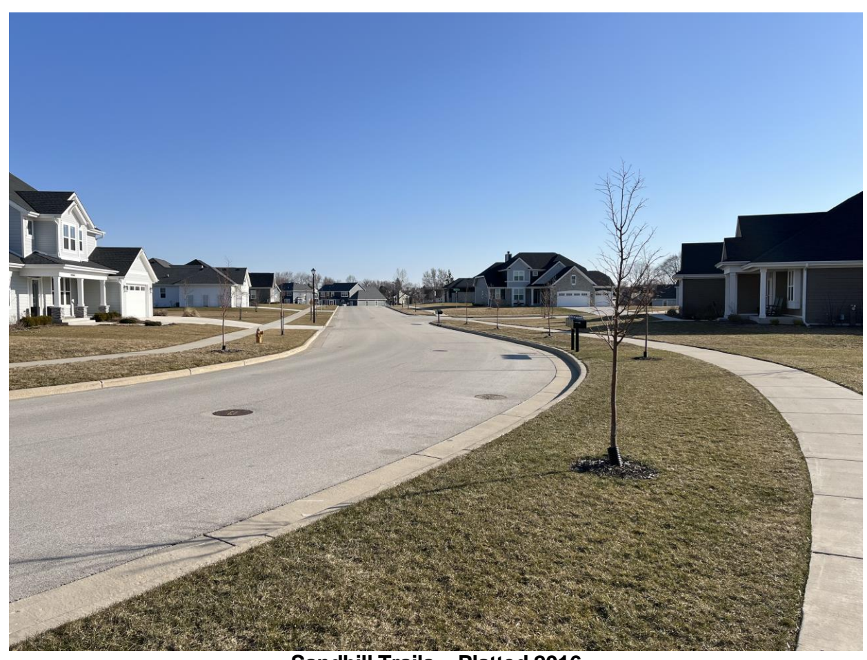
Sandhill Trails - Platted 2016