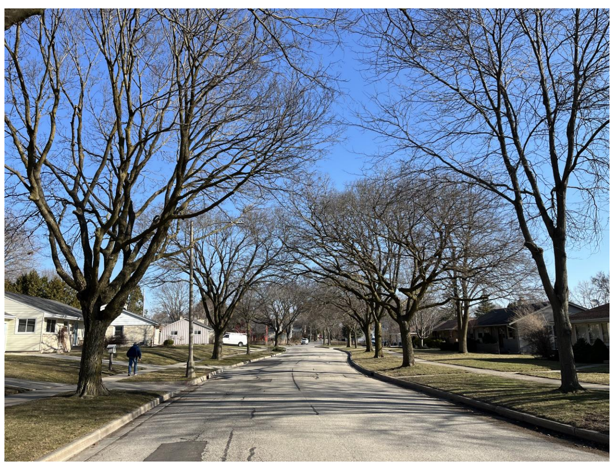
Hilbert Ave. - Platted 1956

The City has used 66 ft. ROW for Minor Streets in the past. Some examples include Hilbert Ave. from Lincoln Blvd. to Wurthmann St. platted in 1956 and the more recent Sandhill Trails and Covington Square East of Keup Trail subdivision. See photos below.